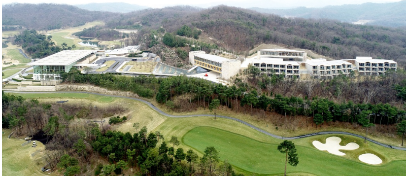
Bird's eye view of all buildings