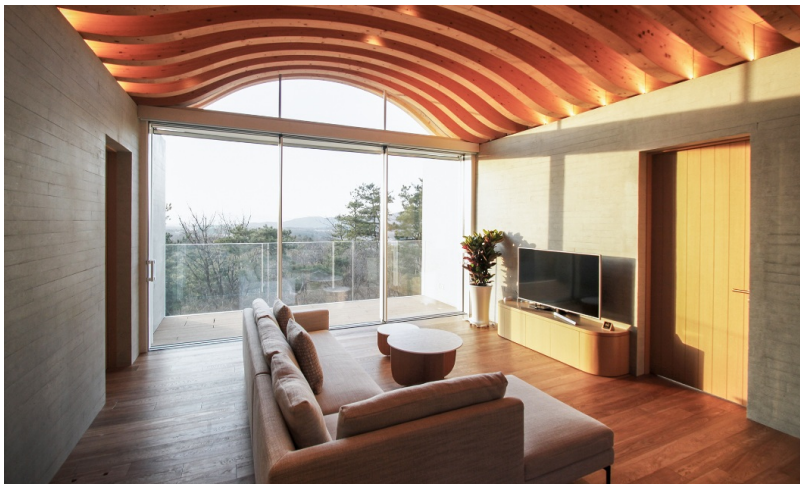
View inside a suite in the Timber House, Condo A