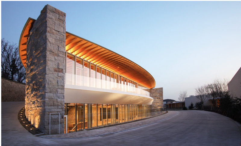
Haesley Nine Bridges Golf Club, Learning Centre at night