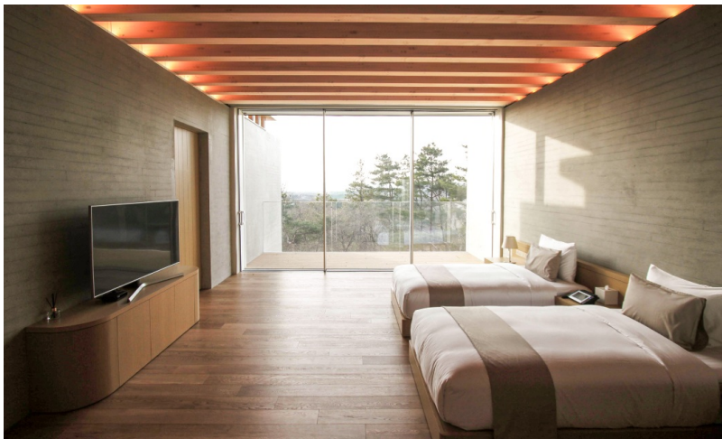
View inside a two-bed bedroom in the Timber House, Condo A