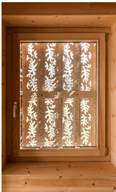
Ornamentation on the facade is also visible inside