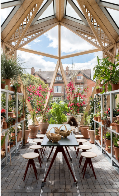
A light and airy interior