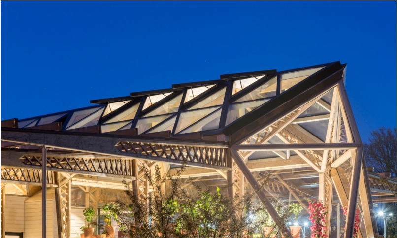
Timber roof construction