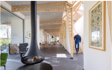
Close-up of the roof construction