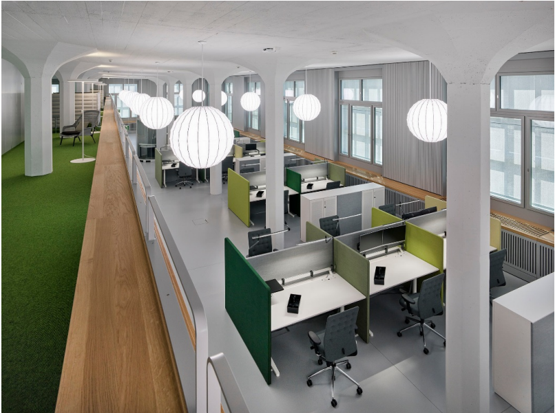
View of the gallery inside the modern office spaces