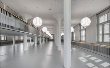
The lounge encourages people to linger. The renovated factory hall was designed with an understated and bright interior.