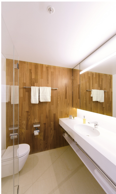
Bathroom module design