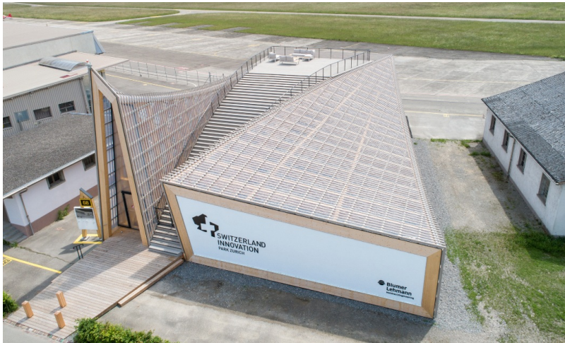
Lighthouse project for the Innovation Park