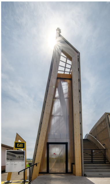
Entrance area in the free-form shell