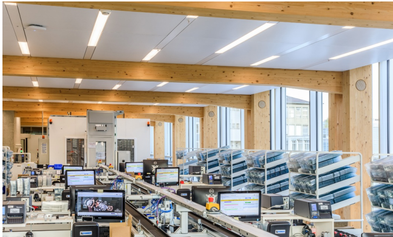
Modern production facilities