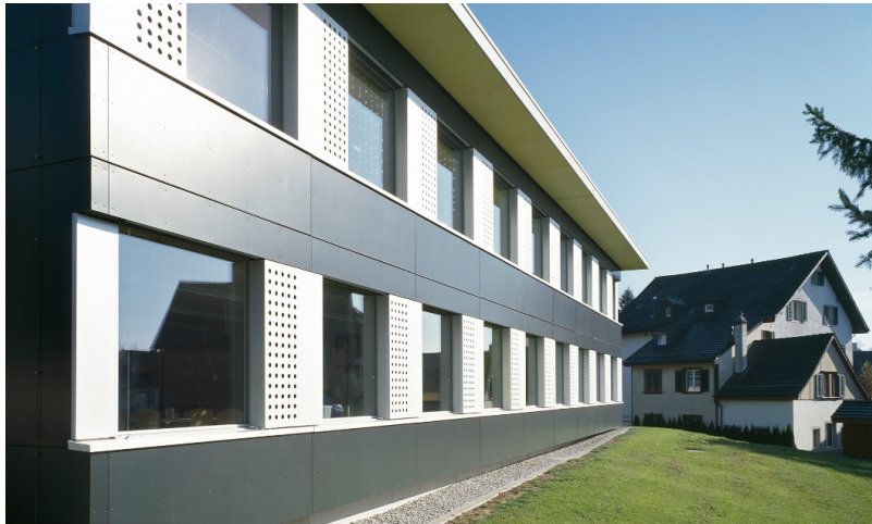
Temporary Hasenacker school building in modular design with facade in anthracite white