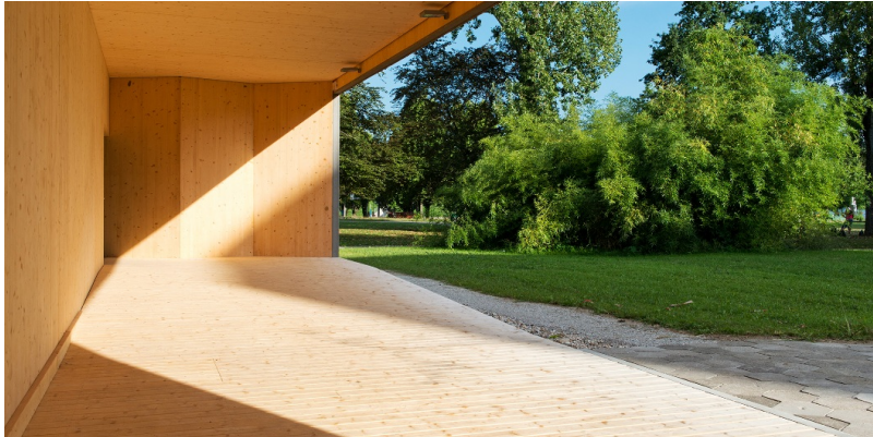
Reception area, Théâtre de Vidy