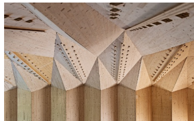
Timber construction details, Théâtre de Vidy