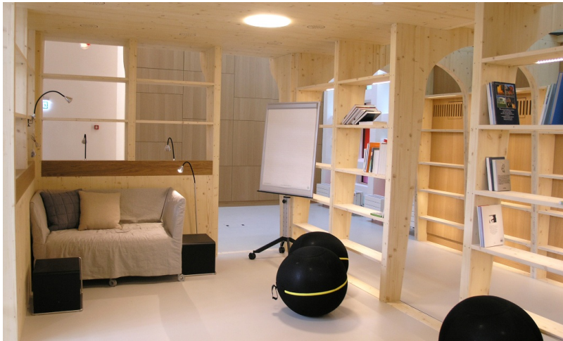
A quiet corner for individual study