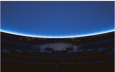
The Wisdome project builds on the world's leading research in visualisation technology and is led by more than ten universities and research institutions.