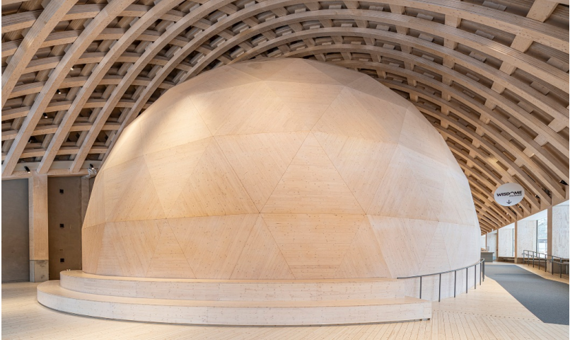
In the dome structure, new perspectives on science topics are shown on the hemispherical screen.