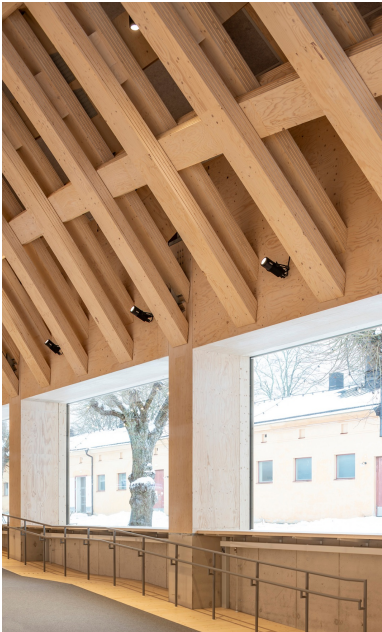
The Planning for the innovative free-form timber construction began in 2021 and construction work construction work could begin.